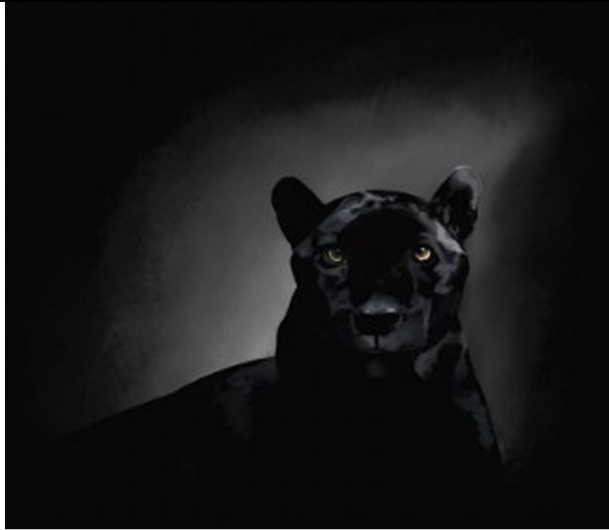
Shadow, Gateway's Mascot